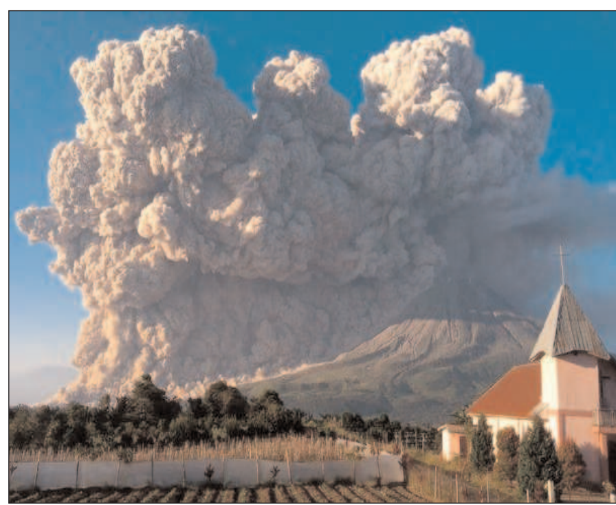
Mount Sinabung spews volcanic material during an eruption in Karo, North Sumatra, Indonesia. The 2,600-metre (8,530-feet) volcano is among more than 120 active volcanoes in Indonesia, which is prone to seismic upheaval due to its location on the Pacific "Ring of Fire," an arc of volcanoes and fault lines encircling the Pacific Basin.

The waste occurred in violation of multiple laws stating that U.S. agencies should not construct or procure capital assets until they can show that the benefiting country has the financial and technical resources and capability to use and maintain those assets effectively, he said.