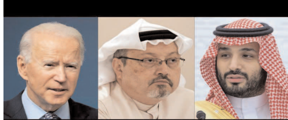
The whereabouts of Khashoggi's remains are unknown, and the Saudis have not released the names of those tried and sentenced