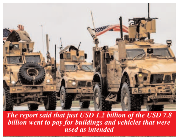
The report said that just USD 1.2 billion of the USD 7.8 billion went to pay for buildings and vehicles that were used as intended

Islamabad: The United States wasted billions of dollars in war-torn Afghanistan on buildings and vehicles that were either abandoned or destroyed, according to a report released Monday by a US government watchdog. The agency said it reviewed USD 7.8 billion spent since 2008 on buildings and vehicles. Only USD 343.2 million worth of buildings and vehicles were maintained in good condition, said the Special Inspector General for Afghanistan Reconstruction, or SIGAR, which oversees American taxpayer money spent on the protracted conflict. The report said that just USD 1.2 billion of the USD 7.8 billion went to pay for buildings and vehicles that were used as intended. The fact that so many cap-