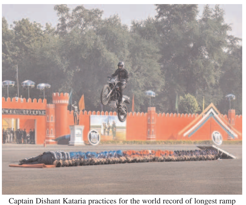
jump with motorbike over 65 lying people covering a distance more than 61ft, in Jabalpur.