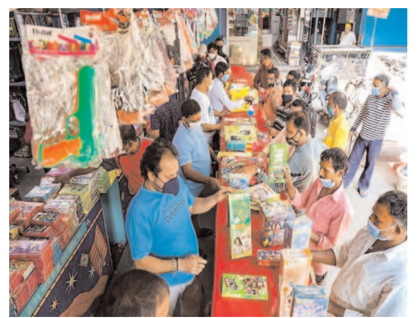
People buy firecrackers despite the government urging public to restrain from bursting crackers during Diwali festival in view of current COVID-19 status, in Thane district.