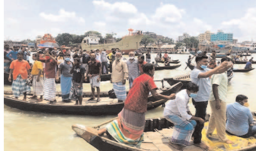
People watch as rescuers bring bodies of passengers recovered from Buriganga River in Dhaka, Bangladesh. A ferry carrying about 100 passengers capsized after being hit Monday by a larger vessel in a Bangladeshi river, killing at least 28 people, officials said.