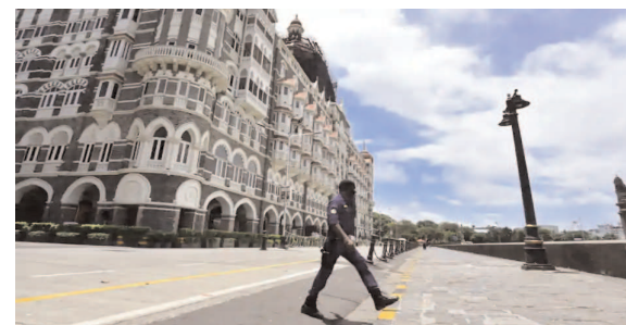
A Mumbai Police official, requesting anonymity, said that the hotel authorities received the threat calls and security has been intensified at the properties.

Quick Reaction Teams (QRTs), counter-terrorism units, etc; have been deployed at both the hotels.