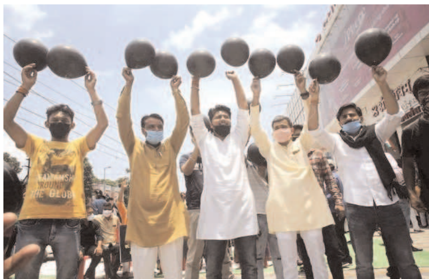
Congress activists stage a protest as they observe 'Black Day' on completion of hundred days of BJP state government, in Bhopal.